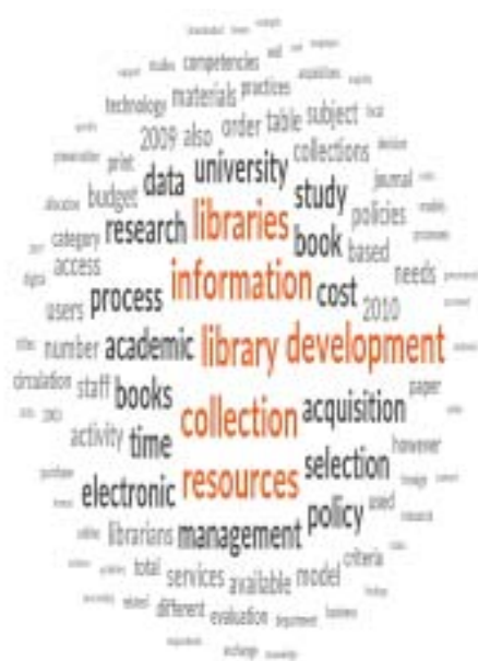
Figure 2: Word Cloud with the literature on acquisition of resources

A tree map is a diagrammatic representation of the hierarchy in data portrayed in set of rectangles varying in sizes as they appear in the literature review. Frequency of the text is mapped accordingly in the tree map. Figure 3 depicts the various areas related to library and information science where acquisition is one of them.